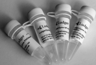
LudgerZyme Recombinant PNGase F Kit - LZ-rPNGaseF-kit