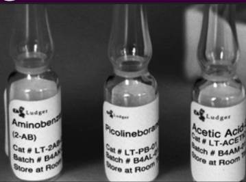
Ludger LT-KAB-VP kits: 2-AB labeling kits with 2-PB reductant